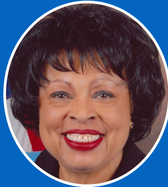
Hon. Diane Watson Ret. House of Rep - CA