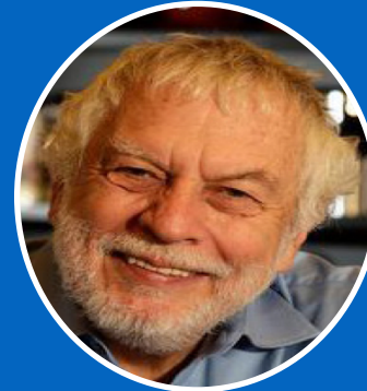
Nolan Bushnell Atari Founder & Chuck E. Cheese